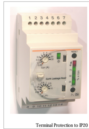
Dims: to DIN 43880 W. 44mm